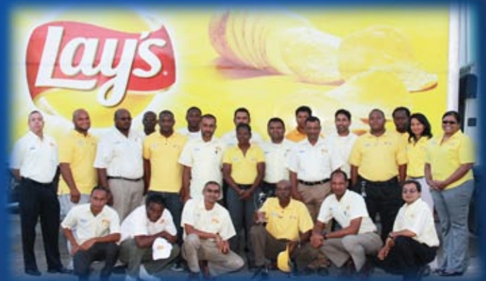
AMCO's Frito Lay Team