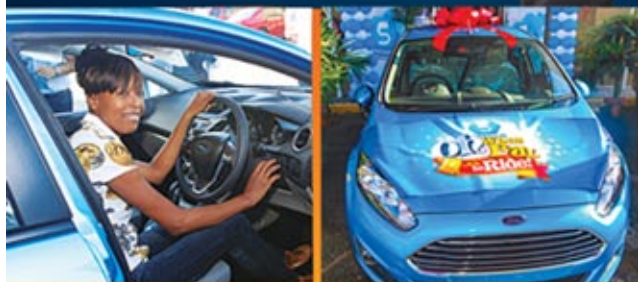
Winner #1 Ford Fiesta