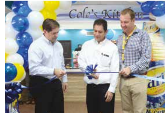
The new Carib Canteen was declared open to employees