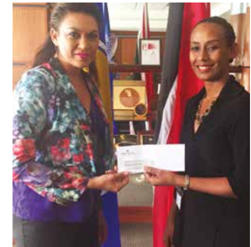
The Dyslexia Association of Trinidad and Tobago received support from The ANSA McAL Group of Companies' Corporate Communications Unit