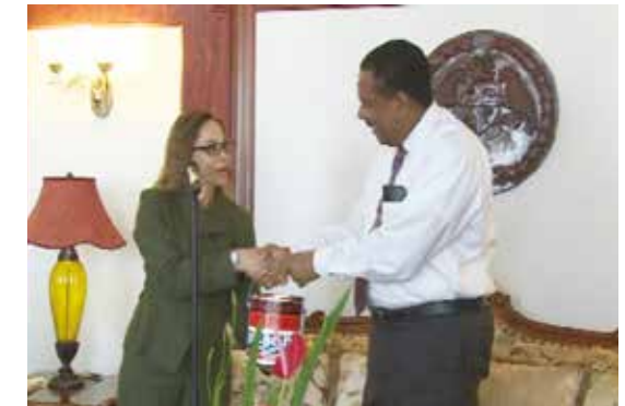
After the devastation of Tropical Storm Erika, the Colihaut Primary School in Dominica received a donation of Sissons Paint to assist in their refurbishment drive