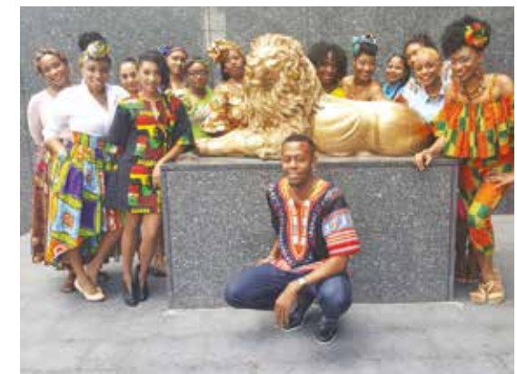
Employees of Alstons Shipping proudly displayed traditional African wear in recognition of Emancipation Day