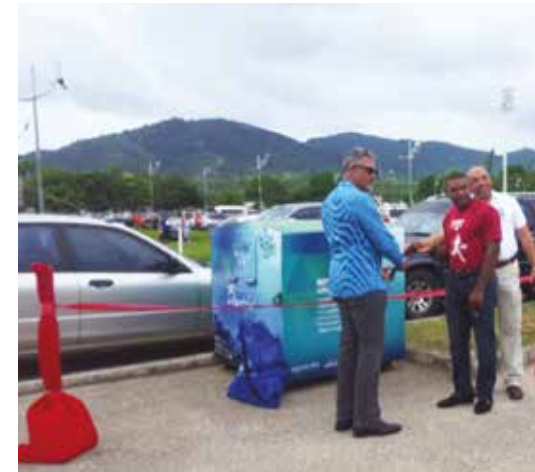
Carib Glassworks Limited (CGL) extended its glass recycling initiative, "Glass Works" to the Tunapuna Piarco Regional Corporation (TPRC) at the Eddie Hart Savannah