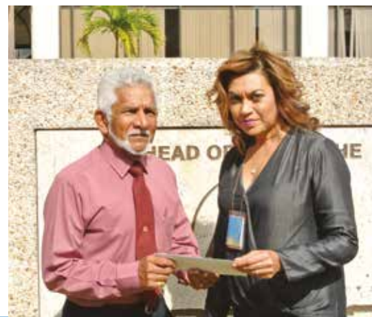
The Trinidad and Tobago Transparency Institute received financial assistance towards its Public Outreach Education Programme