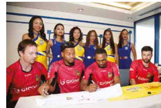
Carib was named the official beer of the Trinbago Knight Riders cricket team for the CPL tournament