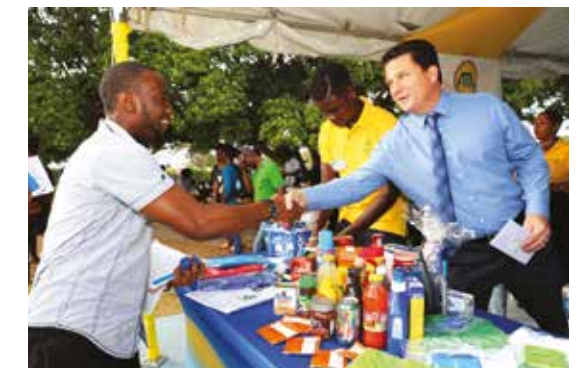
ANSA McAL (Barbados) participated in the annual campus Career Fair at the University of the West Indies, Cave Hill