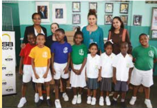
Trinity Junior School was the recipient of three air-conditioning units courtesy ANSA Motors