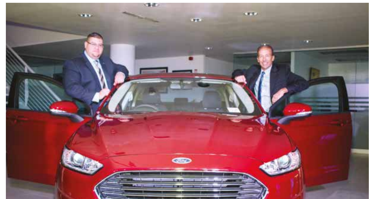
McEneaney Motors unveiled the latest models to join the Ford portfolio