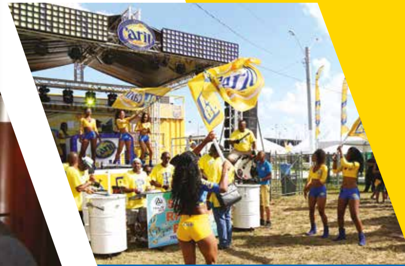
Carib Beer's Blue and Gold Campaign was in full flight on the Greens at the Pan Semis for Carnival 2016