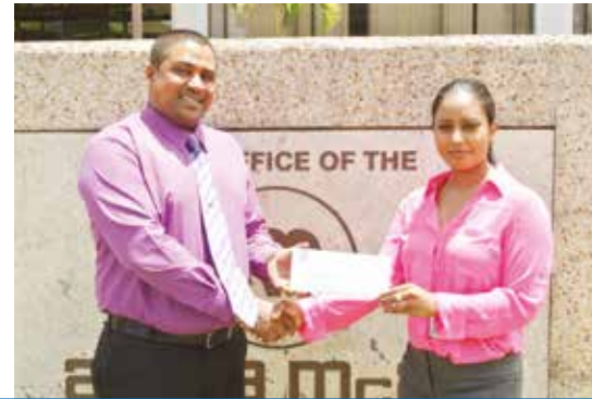
The Sanatan Dharma Maha Sabha received a donation for its cultural activities in recognition of Arrival Day