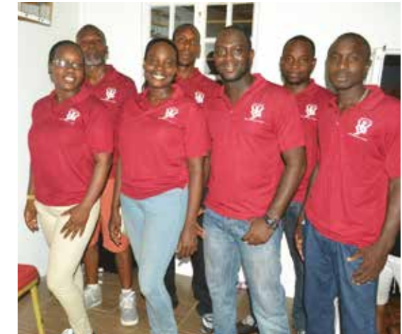
ANSA McAL sponsored branded t-shirts towards "We Are Better Youths" (WABY) 9th Annual Independence Sports and Family Day