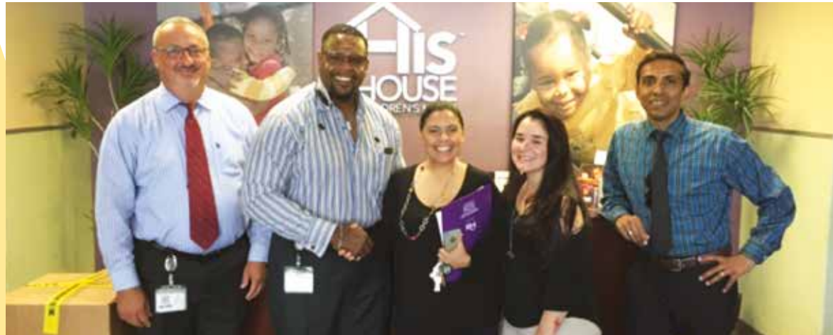
ANSA McAL (US) Inc. provided assistance to His House Children's Home with their New Clothing Bundle Drive