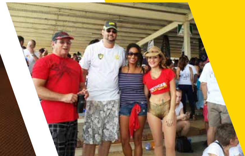
Swinger Matches lit up the Pan Semis for Carnival 2016