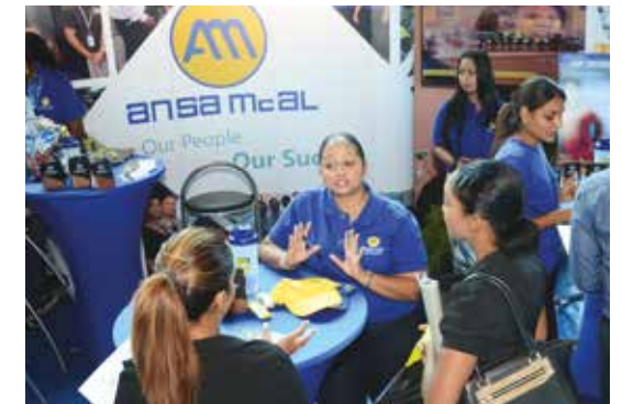
ANSA McAL participated at U.W.I's World of Work (WOW) annual recruitment fair