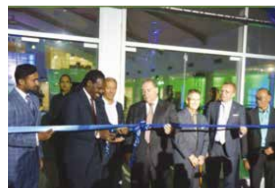
ANSA Motors opened the doors to its Mega Facility showroom located in Chaguanas