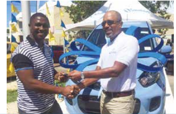
ANSA McAL (Barbados) Limited launched their "Big 50 Giveaway" for the 50th Independence celebrations in Barbados