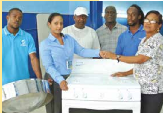
The Group, through Standard Distributors Ltd., donated a 30 inch 4 Burner Gas Cooker to Blue Diamonds Steel Orchestra