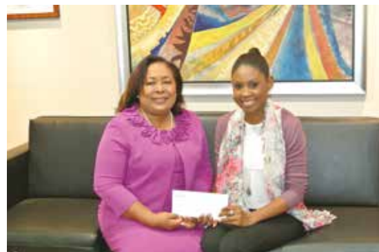
The National Centre for Persons with Disabilities received sponsorship of a bursary courtesy the Group