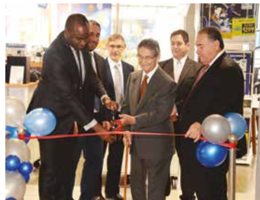
Standard's ANSA House showroom reopened at the corner of Queen and Henry Streets, Port of Spain