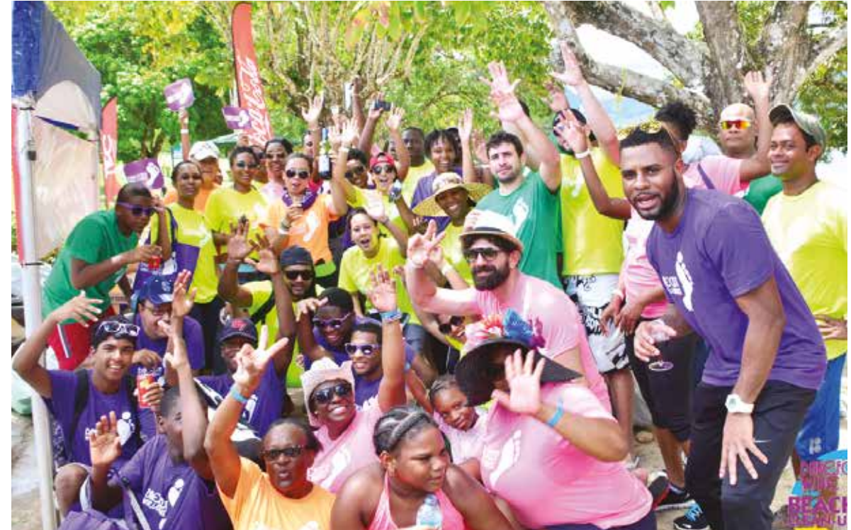
AMCO's Barefoot & Bubbly united with The Caribbean Network for Integrated Rural Development and the Ocean Conservancy's International Coastal Cleanup for a beach clean-up exercise