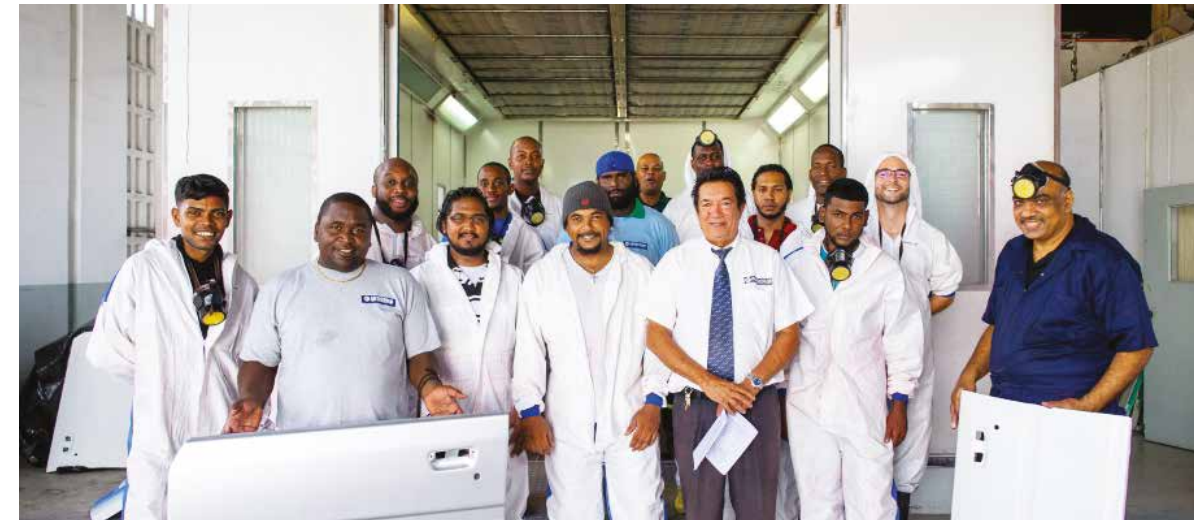
The Automotive Department of ANSA Coatings Limited held a training session on NEXA Automotive 2K Refinish Systems