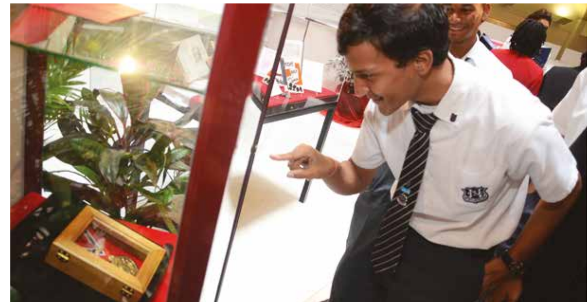
The O.R.T.T was unveiled to the public at NALIS to coincide with Labour Day celebrations in Trinidad and Tobago