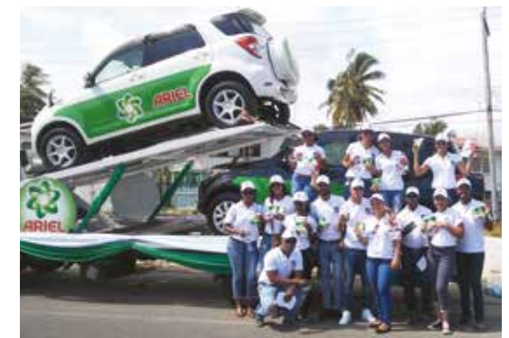
It was a great Christmas for some customers in Guyana as the ANSA McAL Trading (Guyana) – Proctor and Gamble team launched an exciting promotion for the ARIEL brand