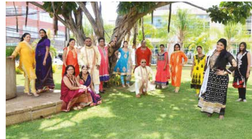
The festival of lights, Divali, was celebrated by employees of the ANSA McAL Group