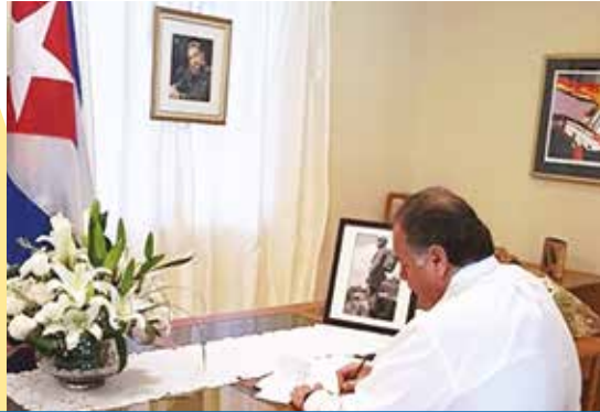
ANSA McAL paid respect to the late Cuban leader, Fidel Castro