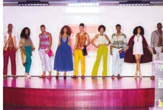
Local designers were featured when ANSA Coatings Ltd. launched their new Sissons Tropical Moderne Colour Collection