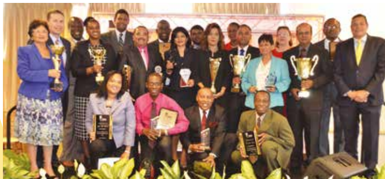
TATIL & TATIL Life Agents were honoured at the company's award ceremony