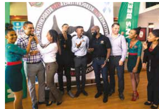
Stag Beer launched the Stag "Beerd" Challenge in a bid to raise awareness and funds for prostate cancer