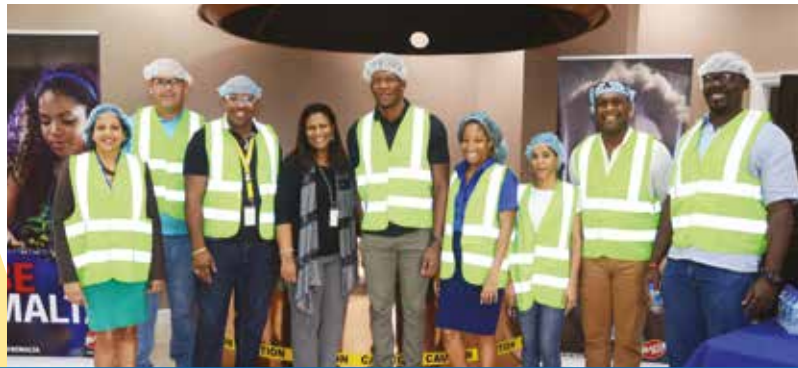
Olympic Champion Keshorn Walcott toured Carib Brewery Limited