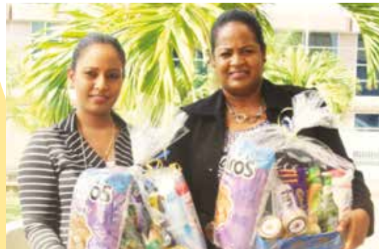
The Group donated gift baskets with AMCO products towards the Trinidad and Tobago Police Division Special Reserve Police annual Sports and Family Day