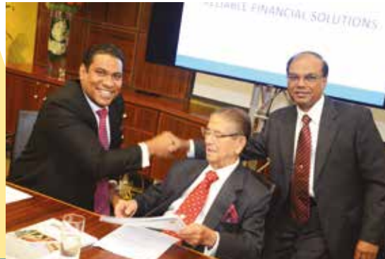
ANSA Merchant Bank Limited recorded its second best year, earning $297 million in profit before tax (PBT)