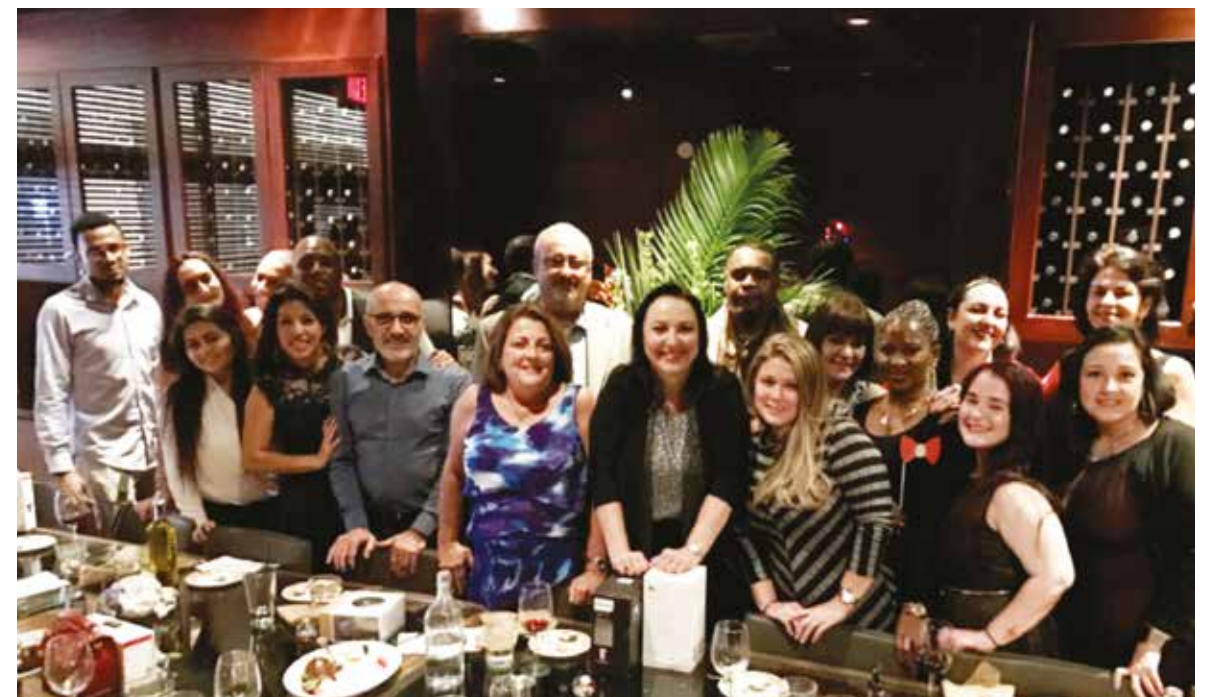
ANSA McAL (US) employees gathered for a Christmas appreciation dinner