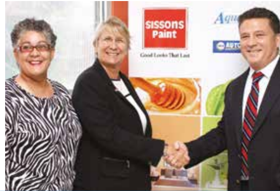
Sissons Paint makes its way to Barbados with its first Franchise