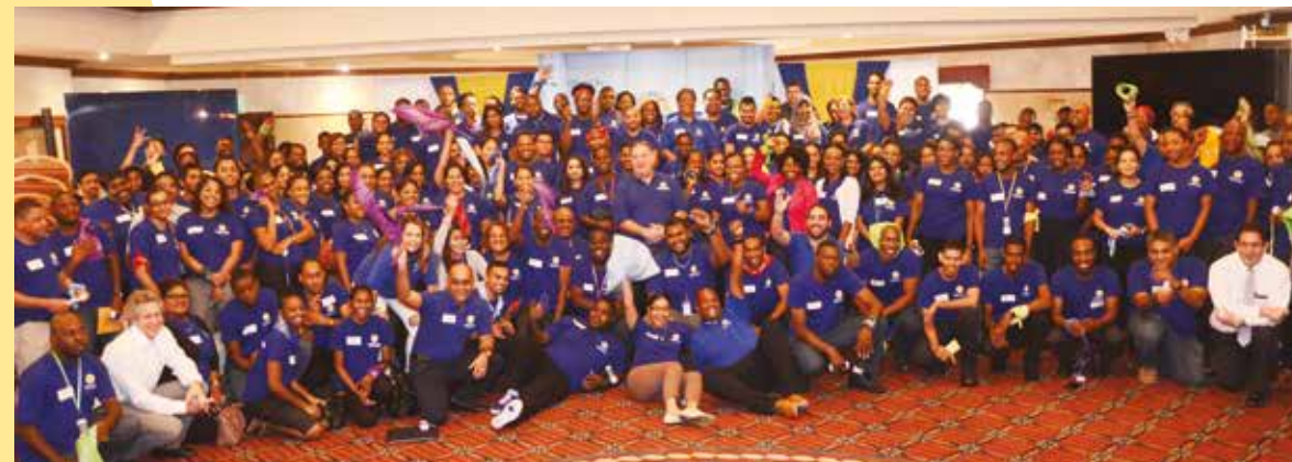
The second HR Orientation for new recruits created a buzz