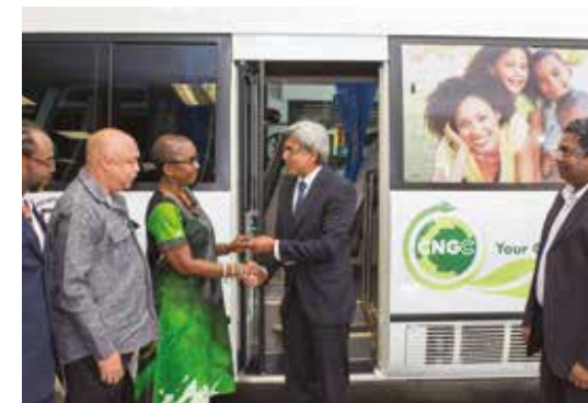
ANSA Motors delivered a Golden Dragon CNG bus to the Trinidad and Tobago Association for the Hearing Impaired