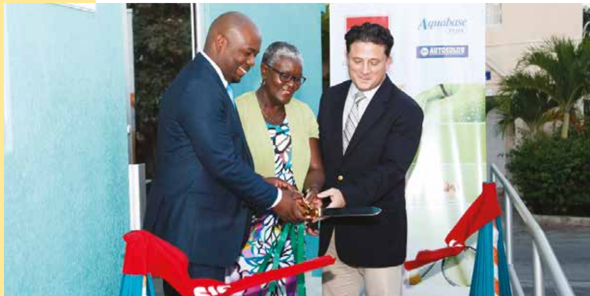
ANSA Coatings Limited launched their first Sissons Paint Colour Shop in Barbados