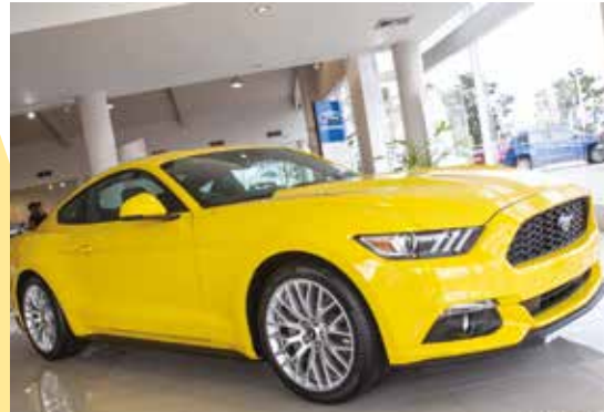
The 2017 Ford Mustang came to Trinidad and Tobago thanks to ANSA Motors