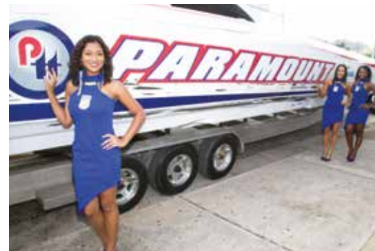
Carib girls posing with Paramount, the new champion of the 48th edition of the Carib Great Race in 2016