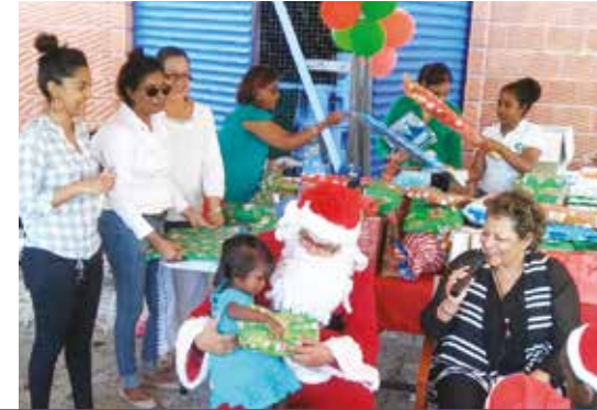
ANSA McAL Trading (Guyana) Limited held its Annual Kids Party for six orphanages within Betervwagting, East Coast Demerara