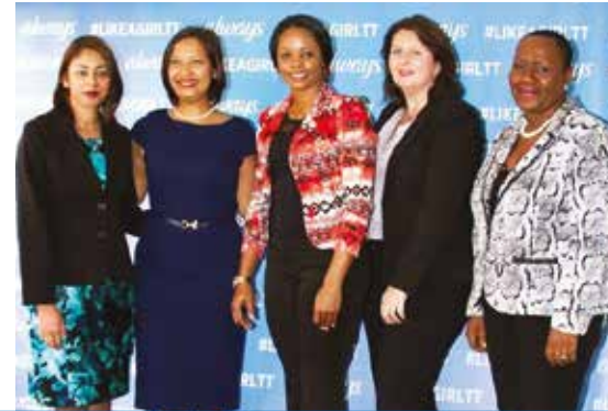
Alstons Marketing Company Limited (AMCO) launched its "Always Like A Girl TT" movement