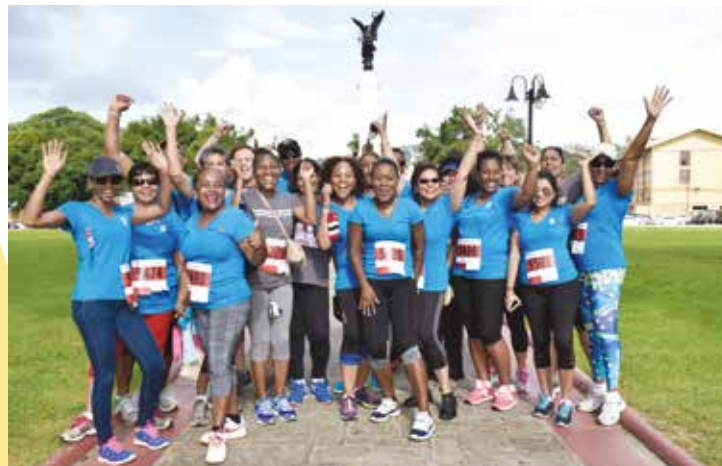
"Tougher than Cancer, Stronger Together"