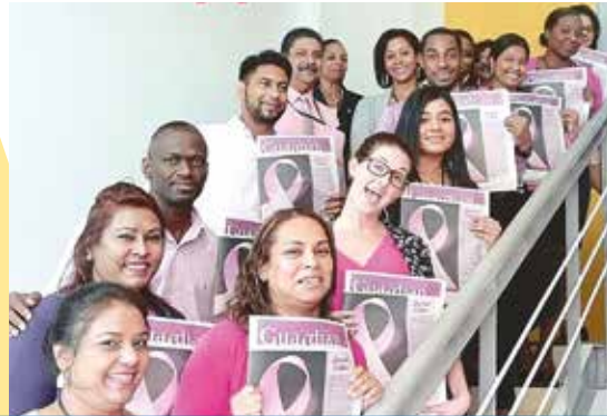
Guardian Media Limited (GML), supported the Trinidad and Tobago Cancer Society in its efforts to fight cancer