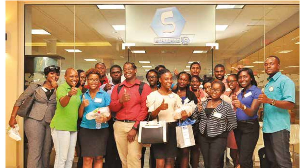
ANSA McAL (Barbados)' 'Summer Internship Programme' received a "Thumbs Up" from its 2016 Interns