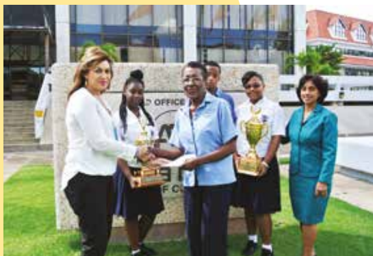
Challenge Trophies were presented to the 1st place winners of the Junior and Senior Secondary Schools' 2016 National Scrabble Championship