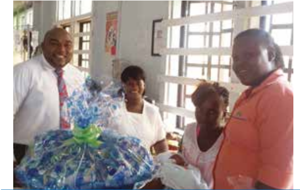
New moms were treated to a "Bundle of Joy" by ANSA McAL Trading (Guyana) Limited