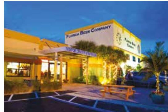
ANSA McAL (US) announced its stock purchase acquisition of Indian River Beverage Corporation (IRBC), which operates the Indian River Brewery under the Florida Beer Company