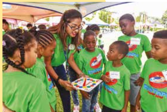
The Zootopia Smalta Children's Camp was an awesome experience for 120 kids