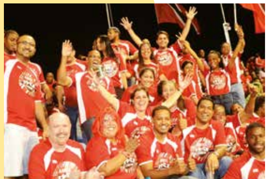
The patriotic ANSA Merchant Bank team supported the Soca Warriors at a qualifying game at the Hasely Crawford Stadium, Port of Spain