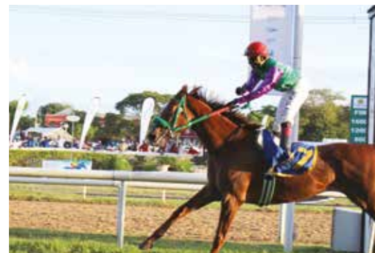
ANSA McAL (Barbados) Horse Racing Festival produced an exciting racing calendar as Barbados celebrated 50 years of Independence