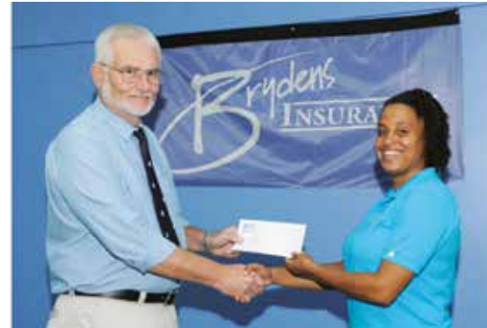
Bryden's Insurance was the first to pledge support for the 2017 edition of the Barbados Relay Fair