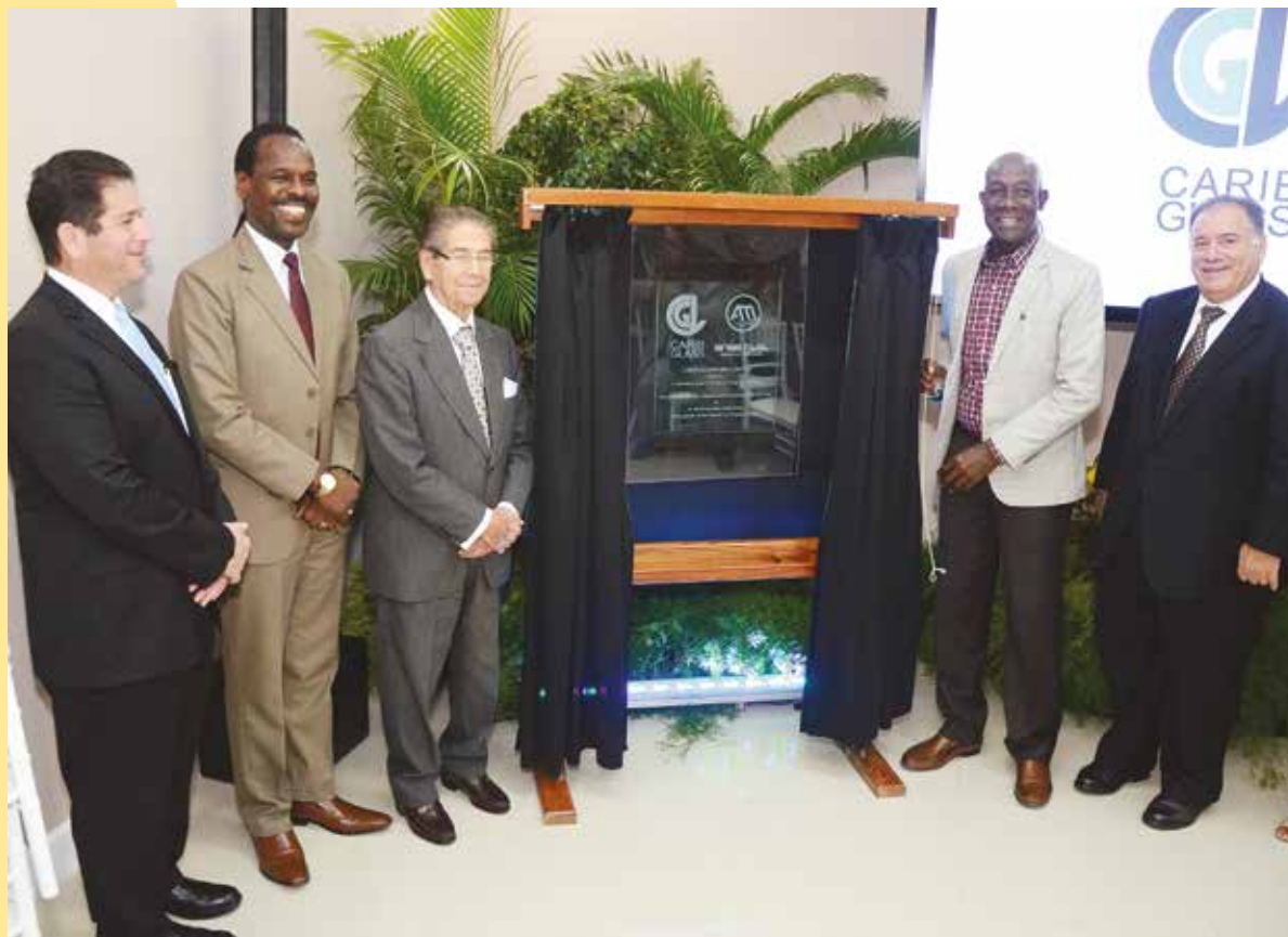
Carib Glassworks Limited unveiled its new Furnace 3 Plant