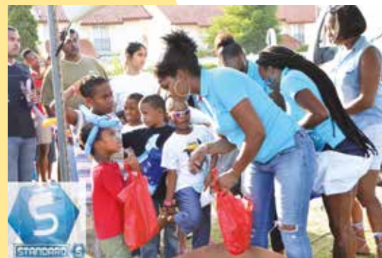
Standard Distributors Limited was all about "Putting Family First" at their annual Sports and Family Day