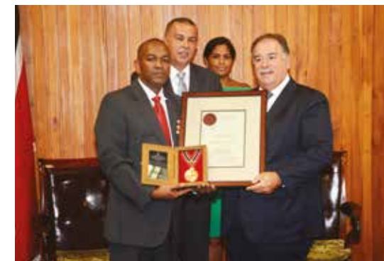
The nation's highest award, the O.R.T.T, was returned to the people of Trinidad and Tobago by the ANSA McAL Group