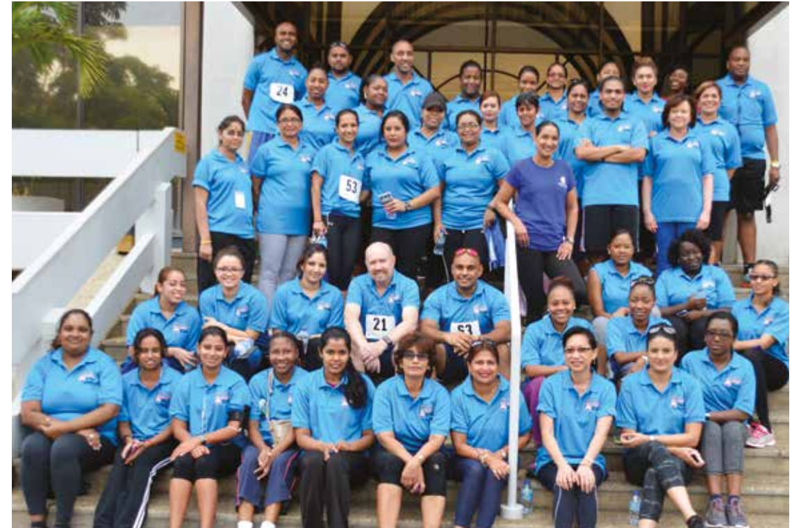
The Financial Services team promoted health and fitness at the 25 th edition of the Carifin games