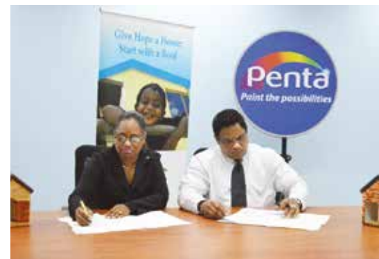
Penta Paints signed a Memorandum of Understanding with Habitat for Humanity, establishing a partnership aimed at painting low income homes for families in Trinidad and Tobago