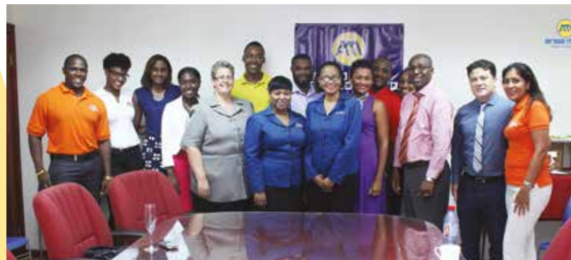
Graduates of ANSA McAL (Barbados) Limited underwent an intensive management development programme delivered by Lewis Consulting Inc.