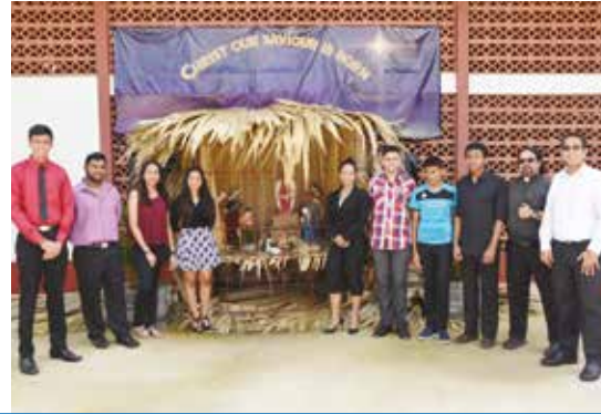
ABS donated two thousand brick pavers to the Curepe Presbyterian Church to restore the church's compound